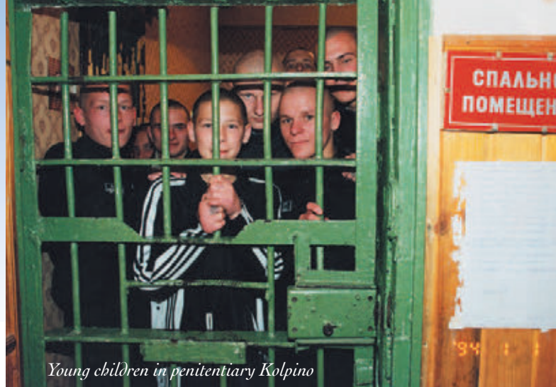
Young children in penitentiary Kolpino