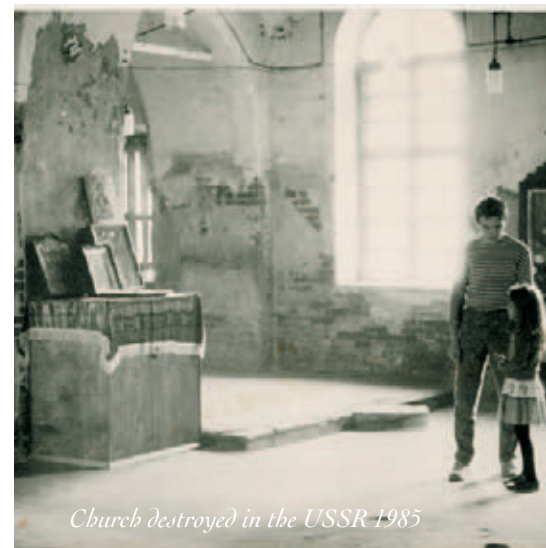
Church destroyed in the USSR 1985

order to be able to serve it better. By bringing together researchers and charitable workers, the conference wanted to take a both practical and academic look at charitable and civil action, as well as the political and social stakes. The high attendance of the two days (between 100 and 150 participants) shows that there is a lot of interest in the subjects covered by the conference.