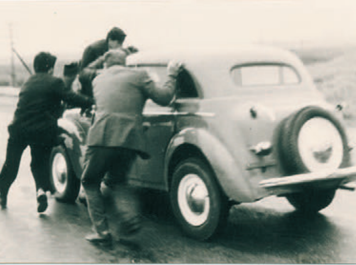
Arrest of believers 60-70 years in the USSR

and political prisoners), and today the destitute (the homeless, children on the street, the ill or the elderly): all that you did for the least of My brothers, you did it unto Me, the Lord told us.