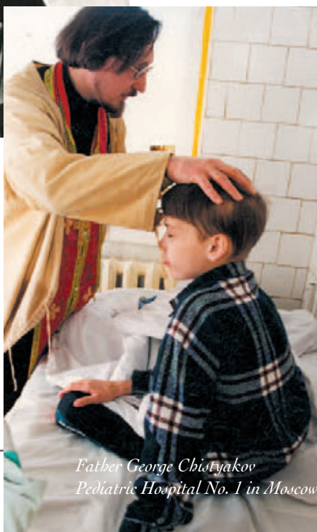
Father George Chistyakov Pediatric Hospital No. 1 in Moscow